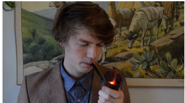
Figure 1: The Peripipe remote control uses illuminated smoke as feedback.

control as a means of musical expression. Unlike these implementations, we did not aim to create a full-scale musical interface but rather an artifact for control, the physicality of which somewhat corresponds with the actions it performs. The Peripipe is crafted from Swedish cherry wood and makes use of the unique aesthetics and qualities that organic materials bring [2]. Additionally, the form factor of the pipe carries cultural value in itself, as smoking pipes have been around for a long time and are connected to meditation and relaxation [5, 1]. Although the numerous health hazards of smoking are now commonly known in western society, smoking pipes currently undergo a revival and are again becoming popular among young people. Providing a hazard-free, yet meaningful pipe as an interface to a music player addresses this trend using the same emotional connection to connect user and technology. Inspired by ephemeral interfaces [7], the user is given feedback in the form of illuminated smoke (see figure 1) which retains a connection to the act of smoking, thus adding to the authenticity of the experience.